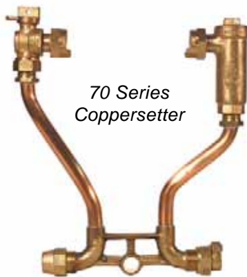
70 Series Coppersetter

In 1935, John L. Ford patented the Coppersetter. Today, Ford Meter Box produces the largest variety of Coppersetters in the industry. They are available with standard AWWA 85-5-5-5 brass, or constructed using no-lead brass components. What has led to the expansive choice of configurations? The world offers many different conditions and requirements for setting a water meter outside. Ford Coppersetters are available for new and existing settings and are engineered to be reliable and simple to install.