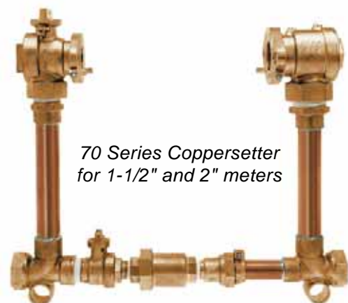
70 Series Coppersetter for 1-1/2" and 2" meters

For larger meter settings, Ford Meter Box offers the 70 Series Coppersetter for 1-1/2" and 2" meters. This large meter setting will provide the same advantages as smaller Ford Coppersetters and is manufactured of the same high quality materials. A wide variety of inlet and outlet connections and valves are available for Ford Coppersetters for 1-1/2" and 2" meters.