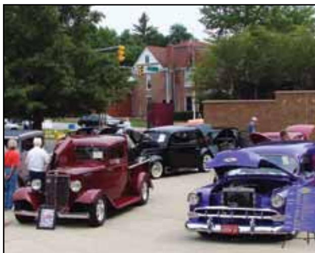
The Dave Kunkel Cruise-In attracts more than 400 classic cars for the annual two-day charity event.

For more information about the Dave Kunkel Cruise-In, visit http://www.kunkelcruise-in.org .