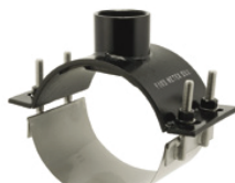
Fabricated Steel Saddles