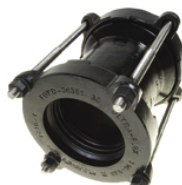
Ultra-Flex FC2W Couplings