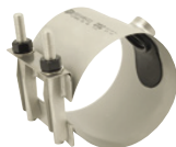
Stainless Steel Saddles