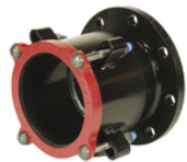
Flanged Coupling Adapters