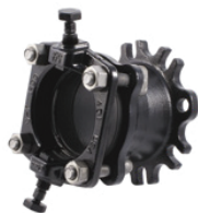
Restrained Flange Adapters