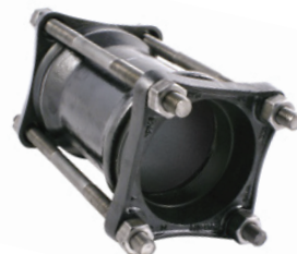
Mechanical Joint Couplings