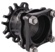
Flange Coupling Adapters