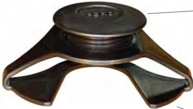
PTP-BR Plug and Universal ERT Bracket

The Universal ERT bracket attaches through a meter box lid with an existing 1-27/32" or 2" AMR hole. The Universal Bracket accommodates most automated meter reading devices and positions the ERT at the top of the meter pit allowing for optimum radio transmission.