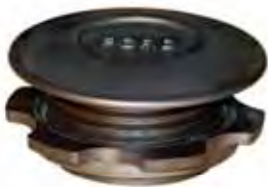
PTP Plug and Nut

For plugging an existing hole to keep debris from entering the pit, order the PTP (plug less the ERT bracket) or PTP-3-25 (plug with a longer shank).