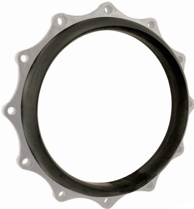
TGA Transition Gasket shown attached to gland