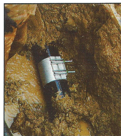
The parting shot. Another Ford repair clamp is buried, never to be seen again!