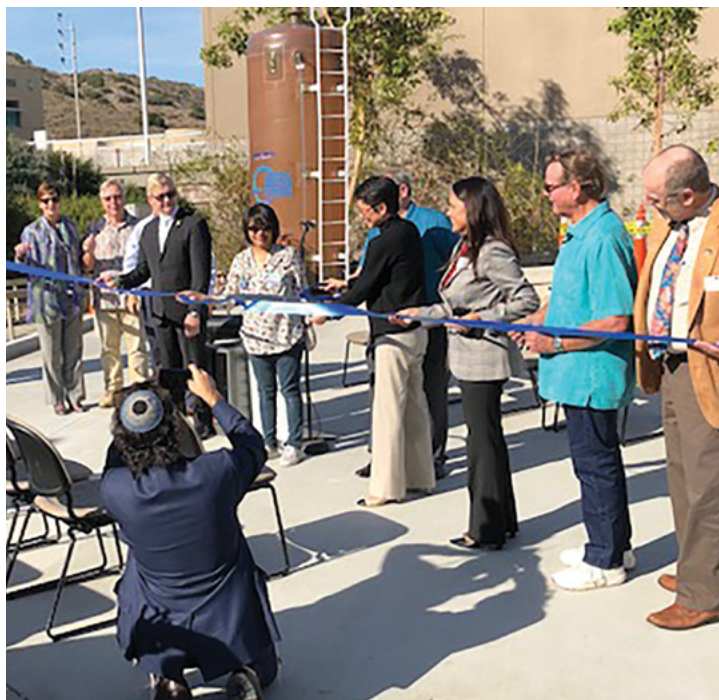
Above: Officials cut the ribbon for the new addition to the Cuyamaca College Center for Water Studies.

Thank you to Cuyamaca College and the Center for Water Studies for your dedication to such an important industry. Ford Meter Box is honored to be a part of this expansion, and to contribute to the future of the water industry and aspiring professionals learning the value of delivering safe and clean water.