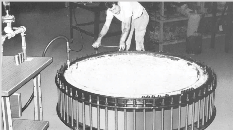
Testing 56" O.D. All Steel Coupling