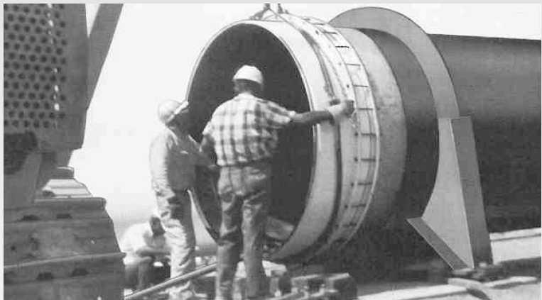
Large Coupling Installation