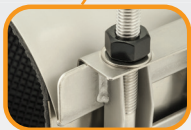
Rounded Corners on Sidebars