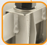
Bi-directional Tapered Lugs