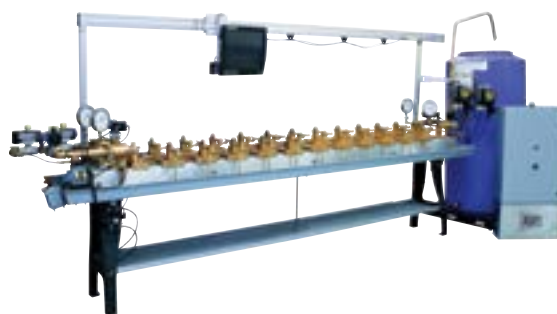
The Ford Automated Measuring System (AMS) water meter test bench (shown above)